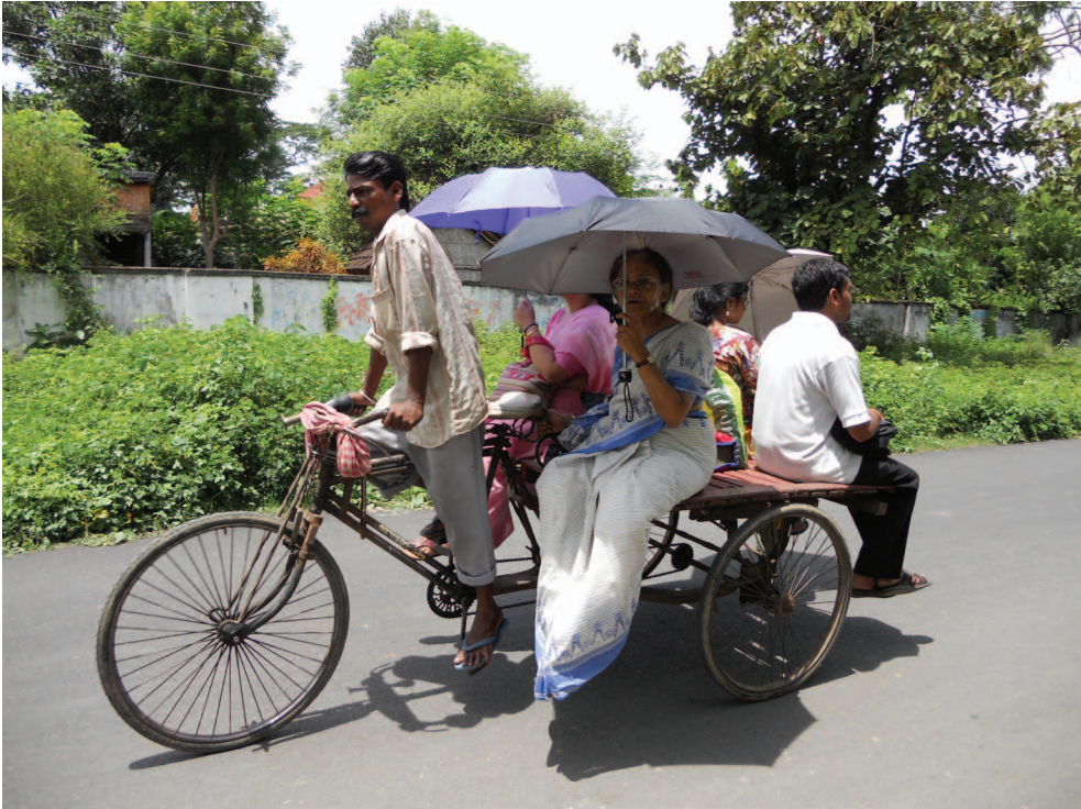
Figure 1. A van-rickshaw for carrying passengers or merchandise. Notes.

the cycle-rickshaw does not carry heavy loads and carries two passengers only. Rickshaws provide self-employment to a large proportion of Indian rural populations. Vehicles like buses, cars, taxis, motor vans, etc., cannot travel through remote areas but van-rickshaws are suitable for transport even on unpaved roads.