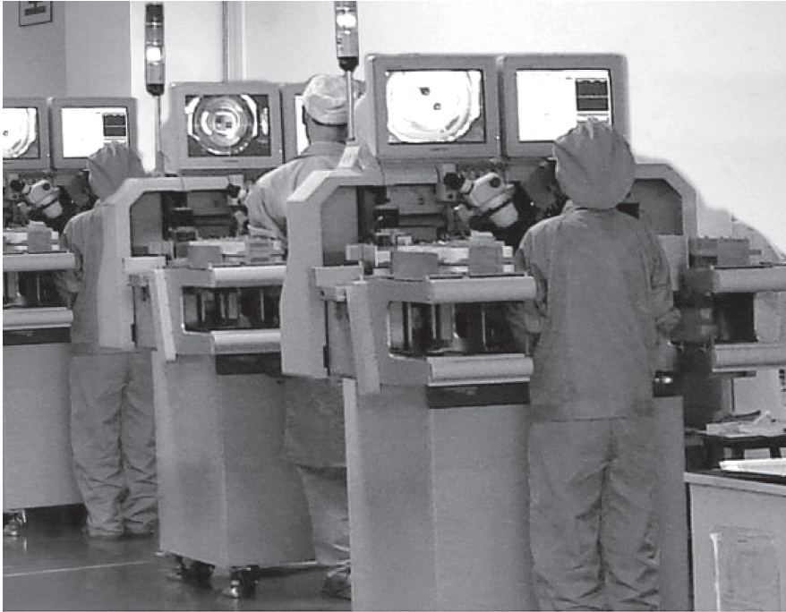
Figure 3. Monitoring bonding machines through viewing video display terminals and microscopes.